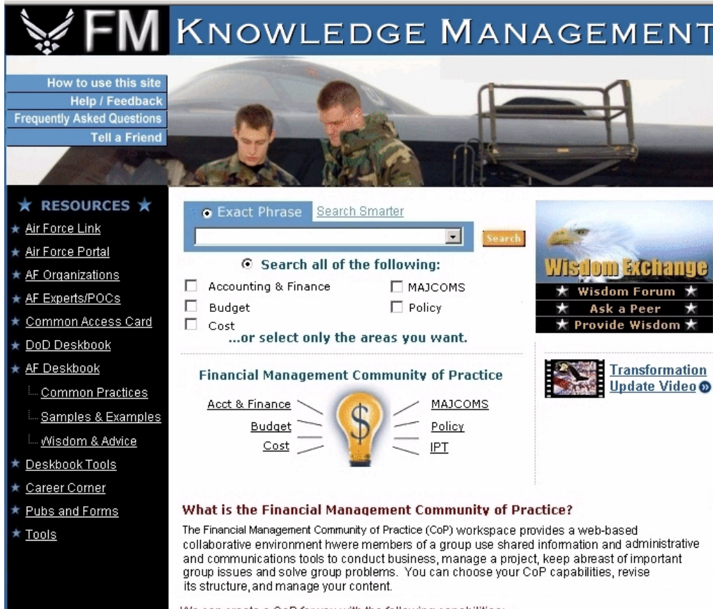
Figure 2. SAF/FM KM System Website Concept.

The next phase of the SAF/FM KM effort focused on continuing to build the CoPs as well as adding new capabilities outside of AFKN that were unique to the SAF/FM KM system. These new capabilities included adding FM article publications, a virtual leadership dialogue, FM video library, FM mentoring, and automated tools forum. Eventually, the FM video library was cut from the effort due to budgetary reasons.