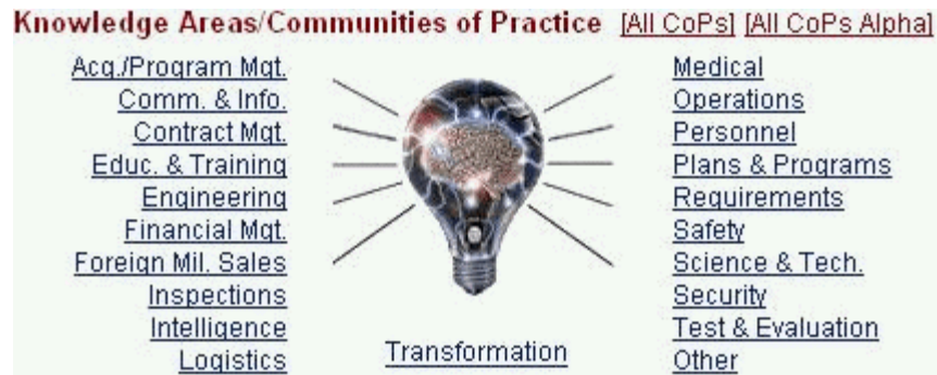
Figure 4. Knowledge Areas of the AFKN System.

The SAF/FM KM system is a knowledge area within the AFKN system. A knowledge area is a top-level functional category within the Air Force. An example of the knowledge areas listed on the AFKN system is shown in Figure 4. Each knowledge area listed on AFKN has specific associated resources such as communities of practice, AF Deskbook documents, experts/POCs, tools, training and/or related sites. The Financial Management knowledge area link on the AFKN site sends users to the SAF/FM KM system entry page.