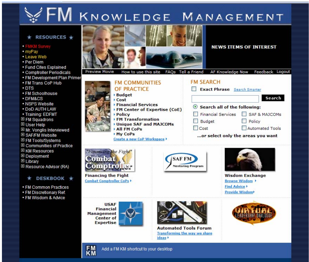
Figure 3. Current View (2007) of the SAF/FM KM System Website.

Currently, the SAF/FM KM system is in a sustainment and growth phase. SAF/FM continues to streamline its KM system through user feedback and keeping a close eye on KM best practices in industry. The SAF/FM KM system as it stands today (2007) is shown in the screen capture in Figure 3. The details and discussion of its features follow.